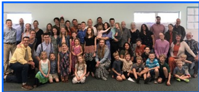
Florida Grace Family Conference at Palma Sola Community Church Bradenton, Florida

with resolute Biblical conviction from the Word of God. More information about this event is available online at www.GraceFamilyMinistries.org .